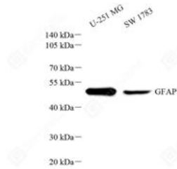
WB analysis of GFAP. Sample: Protein treated by RIPA Lysis Buffer .Blocking buffer: 3% Nonfat dry milk in TBST, RT, 1h. Primary antibody: 1: 1000, 4°C overnight. Secondary antibody: HRP conjugated Goat Anti-Mouse IgG , 1: 5000, RT, 1h.