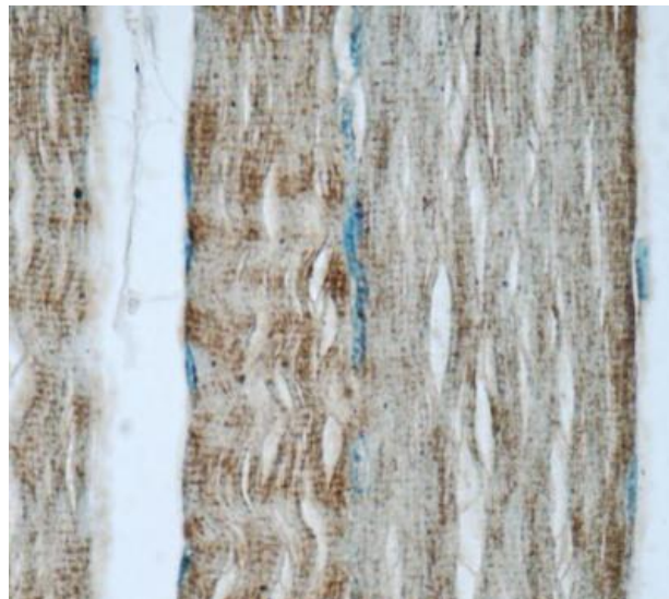
Immunohistochemistry of paraffin-embedded human skeletal muscle tissue slide using (TNNT3 Antibody) at dilution of 1:50